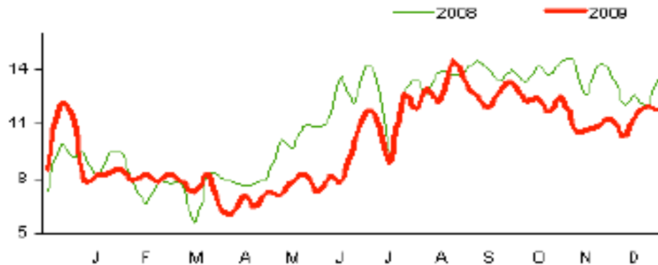
Figure 1. NI Sheep Slaughtering ('000 head per week)

The impact of religious festivals on lamb demand in the British Isles is very clear given that Easter is typically associated with peak demand. However, the impact of the Muslim festival of Eid ul-Adha will not have been lost on any sheep farmers who sold lamb in November 2009. Due to increased ethnic demand, prices rose steadily in November in the run up to the festival, which occurred on the last weekend of the month. It is also worth noting that reduced retail prices during November also led to increases in general retail demand, which in turn drove up farmgate prices. We noted in the Bulletin at the time that the ethnic lamb market is no longer a niche business. With Muslim's making up 3% of