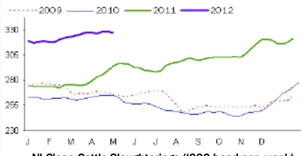
NI Clean Cattle Slaughterings ('000 head per week)