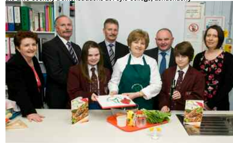
Image 1: Representatives from LMC, UFU and NIMEA at the recent launch of the LMC Cookery Demonstrations at Foyle College, Londonderry