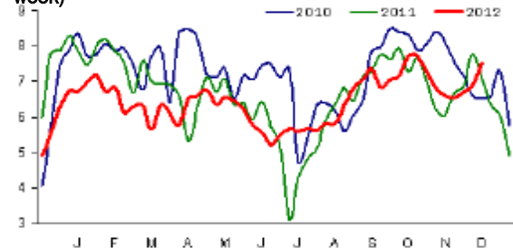
Figure 2: NI Clean Cattle Slaughterings ('000 head per week)

PRIME cattle slaughterings in NI for the year to date are 309,725 head. In the same period in 2011 323,353 prime cattle were slaughtered, a 4.2 per cent drop in the throughput of prime cattle between the two periods. Early in 2012 the prime cattle throughput was markedly below the levels seen in the corresponding period in 2010 and 2011 as indicated in Figure 2 but as the year has progressed cattle throughput has recovered. Prime cattle throughput during the month of November 2012 has been 26,763, a 3.8 per cent increase on the number killed in November 2011. Despite an overall 4.2 per cent drop in the number of prime cattle slaughtered in 2012 the amount of beef produced has only decreased by 2.9 per cent. This is due to an increase in the average prime carcase weights for the year to date to 340kg, up from 335kg in the same period last year. The breakdown of the prime kill has remained fairly consistent to previous years with 48.3 per cent of the kill made up of steers, 34.5 per cent made up of heifers and 17.2 per cent young bulls. The cow kill for the year to date is currently running 8.7 per cent ahead of the same period last year at 90,055 head.