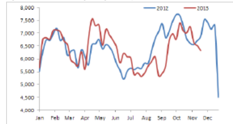
Figure 1: Prime cattle slaughterings January 2012 to November 2013